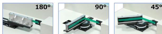
Figure 1 – Sample stage in different positions

In particular, the 45° peel angle shows a remarkable difference in the peel force between both samples.